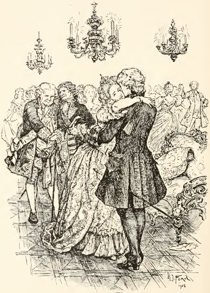
BROTHER & SISTER MEET AGAIN

'Go and embrace the crown prince,' said Grumkow. And she went.